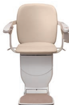
Model Shown - Siena for straight stairs in Ivory vinyl upholstery

Two chair widths - a standard arm width and a new XL arm width version tailored to the user and their staircase. (Standard width shown opposite - XL version shown below).